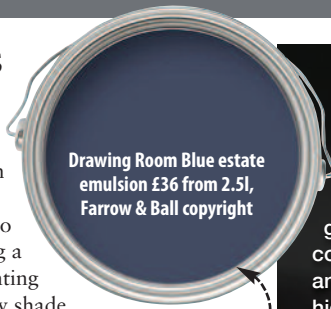
Drawing Room Blue estate emulsion £36 from 2.5l, Farrow & Ball copyright

Marsala may have been named Pantone's colour of year in 2015 but from rich jewel tones right through to deep indigo it seems blue is having a moment too. Try painting your walls a deep inky shade of blue like Drawing Room Blue from Farrow & Ball to give a room a dramatic moody feel. But don't worry, we won't be seeing the end of grey yet although darker shades like charcoal are beginning to take over from the paler greys of the last few years.