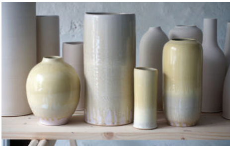
Unika Danish handmade ceramics from Tortus Copenhagen.