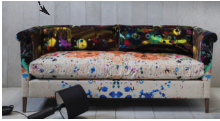
Noelle Sofa in customised Timorous Beasties' Graffito Velvet

Pinch, the award-winning London husband and wife design team, is 10 years old this year. To help them celebrate they launched a collaboration with their friends at Timorous Beasties, creating Graffito Velvet a head-turning fabric made especially for their iconic Noelle Sofa. It's a gorgeous fusion of glamour and rock and roll attitude.