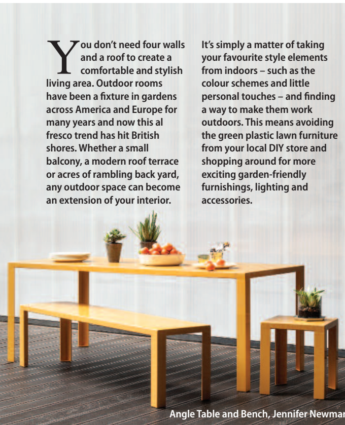
Angle Table and Bench, Jennifer Newmar

It's simply a matter of taking your favourite style elements from indoors – such as the colour schemes and little personal touches – and finding a way to make them work outdoors. This means avoiding the green plastic lawn furniture from your local DIY store and shopping around for more exciting garden-friendly furnishings, lighting and accessories.