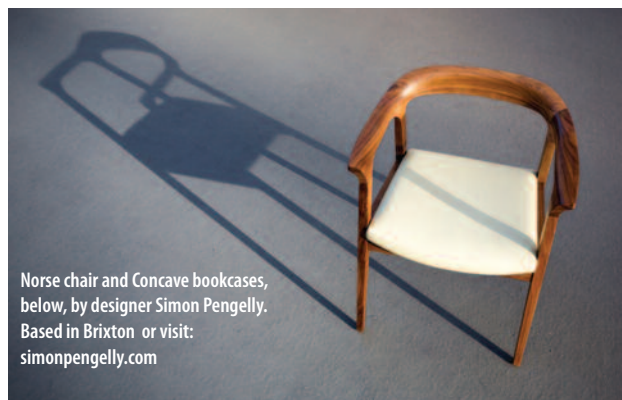
Norse chair and Concave bookcases, below, by designer Simon Pengelly. Based in Brixton or visit: simonpengelly.com

I liked the large format designs of Porcelain Tiles, these giant tiles are striking and unique. Porcelain Tiles supply tiles to some of the most prestigious homes and commercial properties in London. There was quite a buzz around the stand.